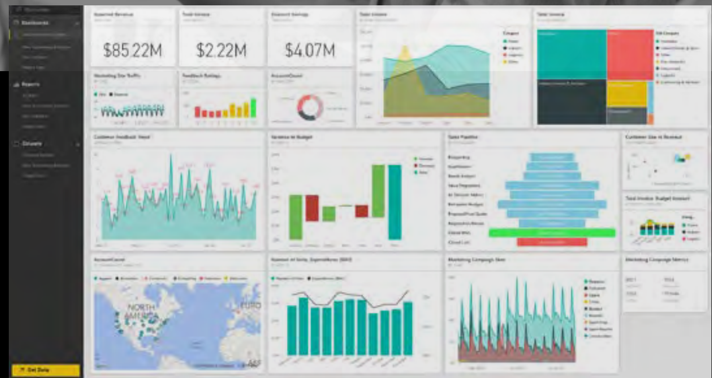
The comprehensive Power BI dashboard

The Modern Workplace broadcast explains even more use cases for Power BI